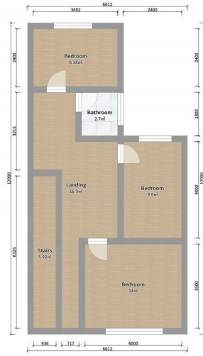
Warwards Lane First Floor